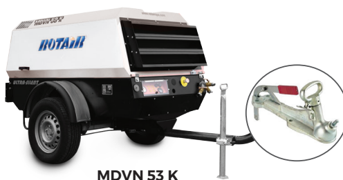
MDVN 53 K