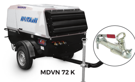
MDVN 72 K