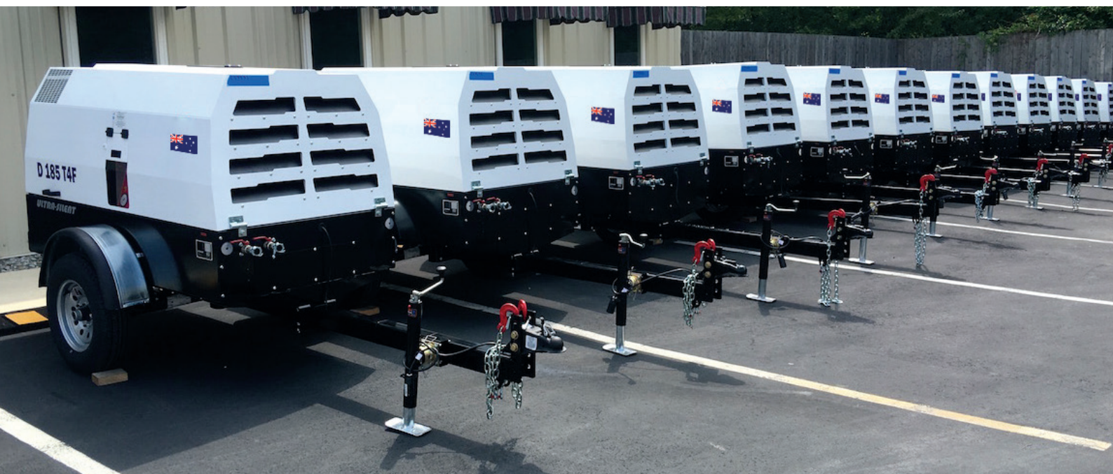
Machines can be ordered on Skid Mount or on Trailer