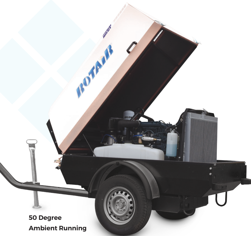
50 Degree Ambient Running