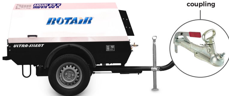
50mm towball coupling