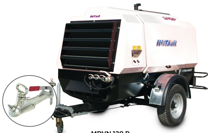
MDVN 120 P