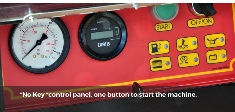
"No Key" control panel, one button to start the machine.

In more than 91 countries around the world, Rotair Air Compressors have distinguished themselves as products that can be depended upon for value, reliability and performance.