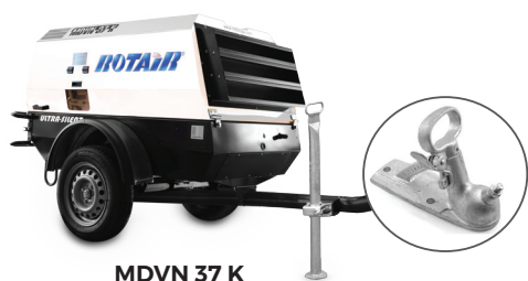
MDVN 37 K