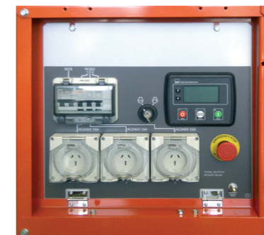
GL-9000 CONTROL PANEL