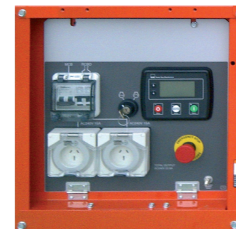
GL-6000 CONTROL PANEL

The Kubota super mini vertical diesel engines are water cooled and have increased performance for dependable horsepower and when direct coupled to the generator, provide continuous power output levels with minimum power loss.